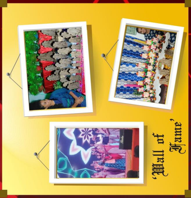
'Wall of Fame'