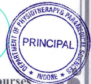
Principal Paramedical Courses