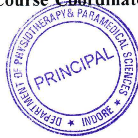
Principal Paramedical Courses