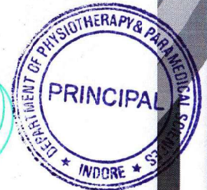
Principal Paramedical Courses