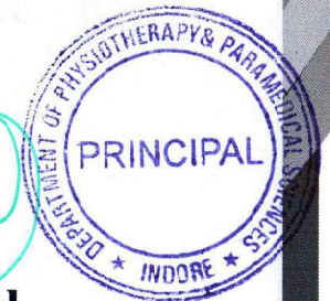
Principal Paramedical Courses