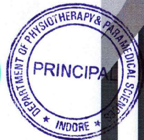
Principal Paramedical Courses