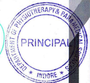
Principal Paramedical Courses

Registrar Malwanchal University Indore (M.P.)