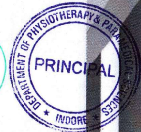
Principal Paramedical Courses

Registrar Malwanchal University Indore (M.P.)