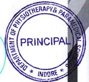
Principal Paramedical Courses

Registrar Malwanchal University Indore (M.P.)