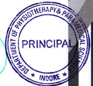
Principal Paramedical Courses

Registrar Malwanchal University Indore (M.P.)