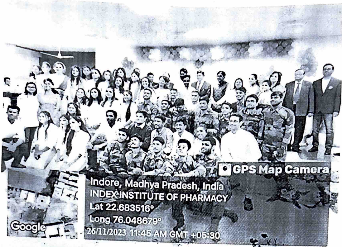
Celebrating Azadi ka Amrit Mahotsav on Index institute of pharmacy