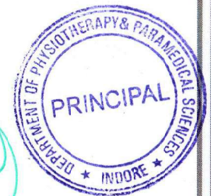
Principal Paramedical Courses

Registrar Malwanchal University Indore (M.P.)