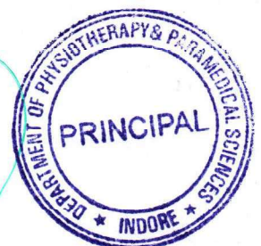
Principal Paramedical Courses