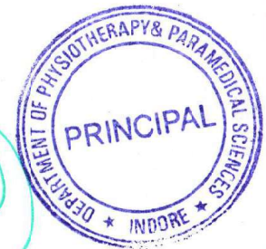
Principal Paramedical Courses

Registrar Malwanchal University Indore (M.P.)