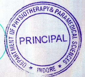
Principal Paramedical Courses