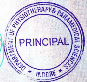
Principal Paramedical Courses

Registrar Malwanchal University Indore (M.P.)