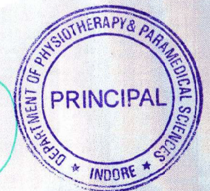
Principal Paramedical Courses

Registrar Malwanchal University Indore (M.P.)