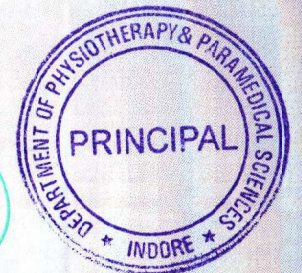
Principal Paramedical Courses