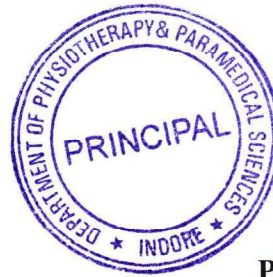
Principal Paramedical Courses