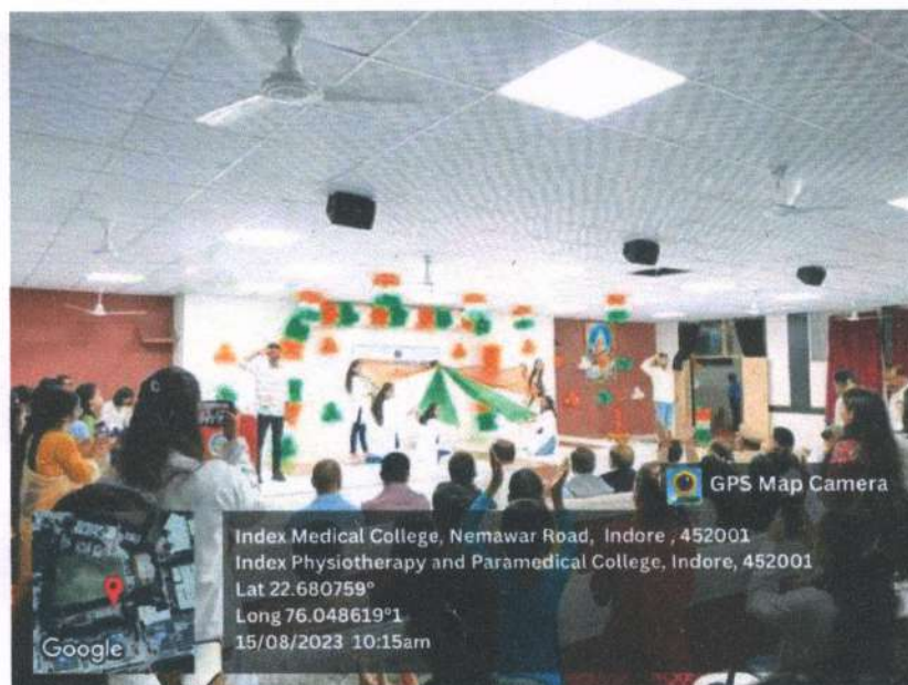
Dance Performed by BPT students