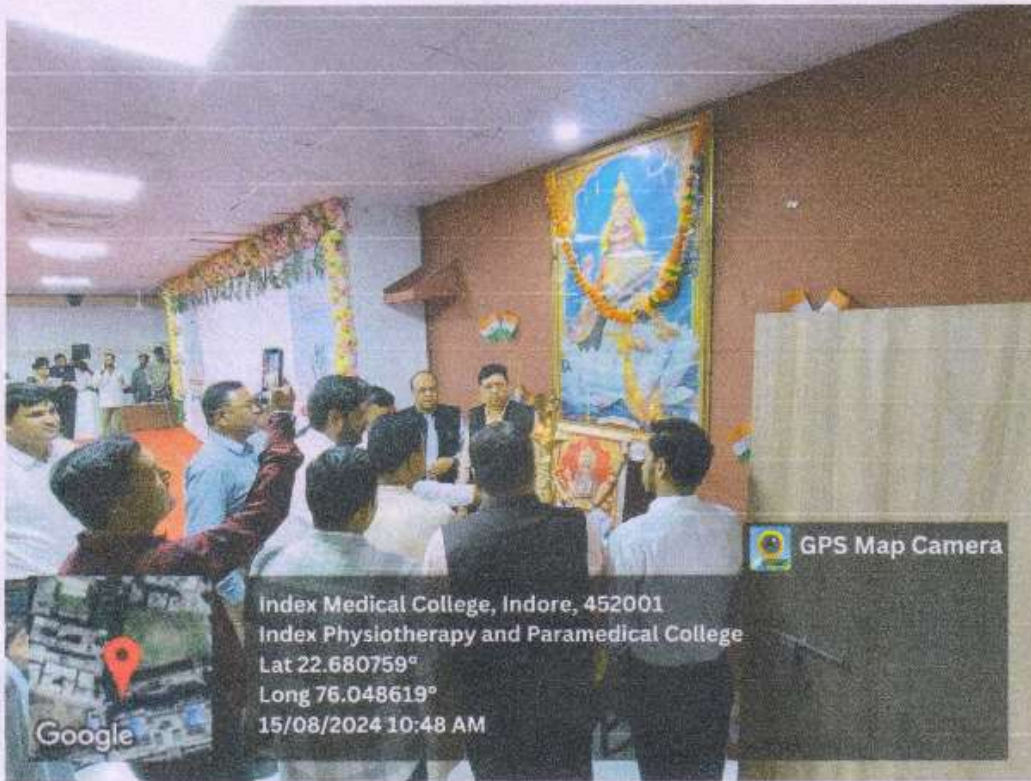
Saraswati Pooja by Chairman Sir & other dignitaries on 78 th Independence Day