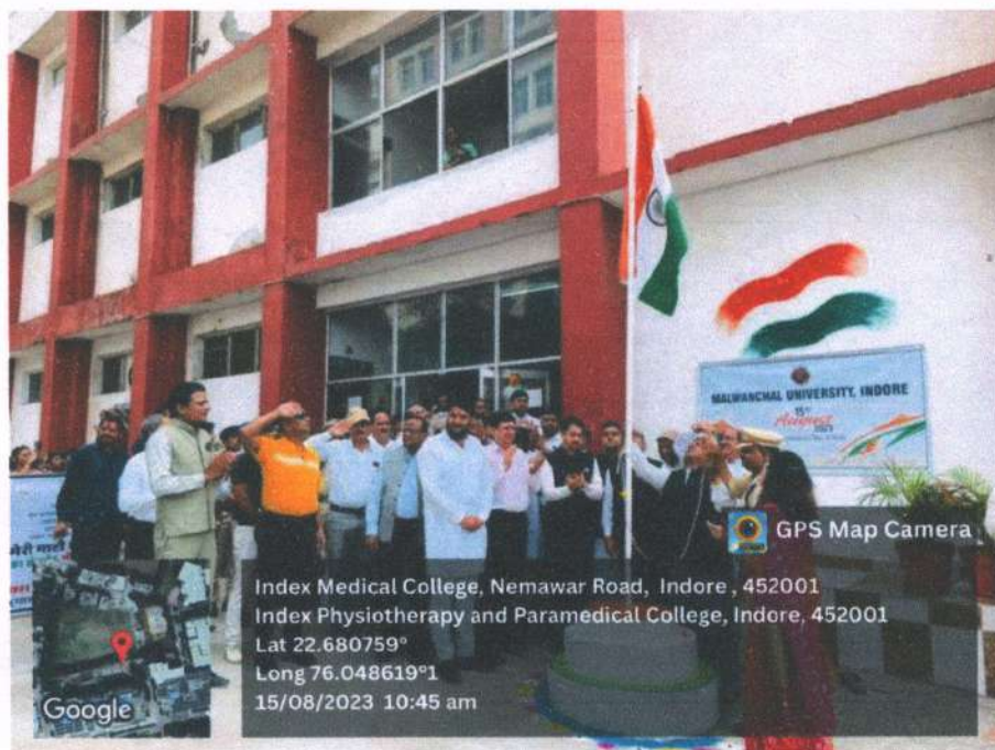
Flag Hosting by Dignitaries