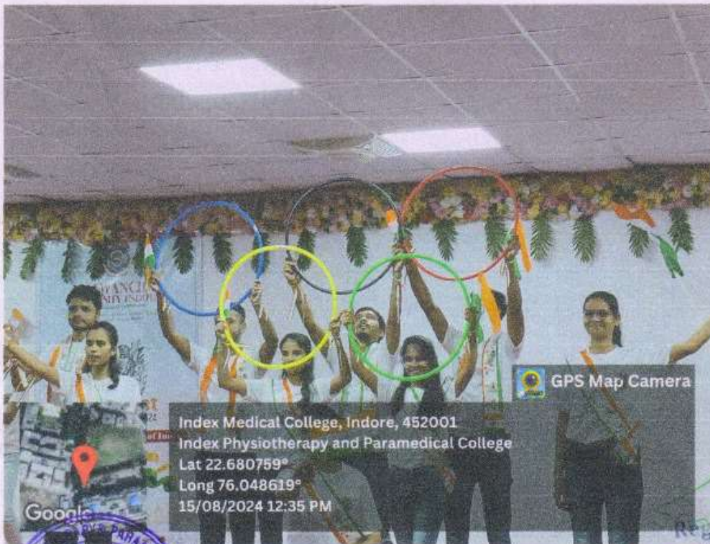
Dance Performed by BPT Students.

[Handwritten signature] PRINCIPAL DEPARTMENT OF PHYSIOLOGY & PARAMEDICAL SCIENCES INDORE