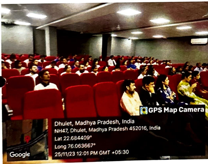
Felicitation of the speaker