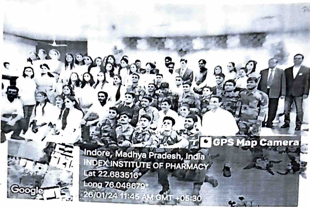
Celebrating Republic day

The glimpse of students present on the celebration of the event are shown below: