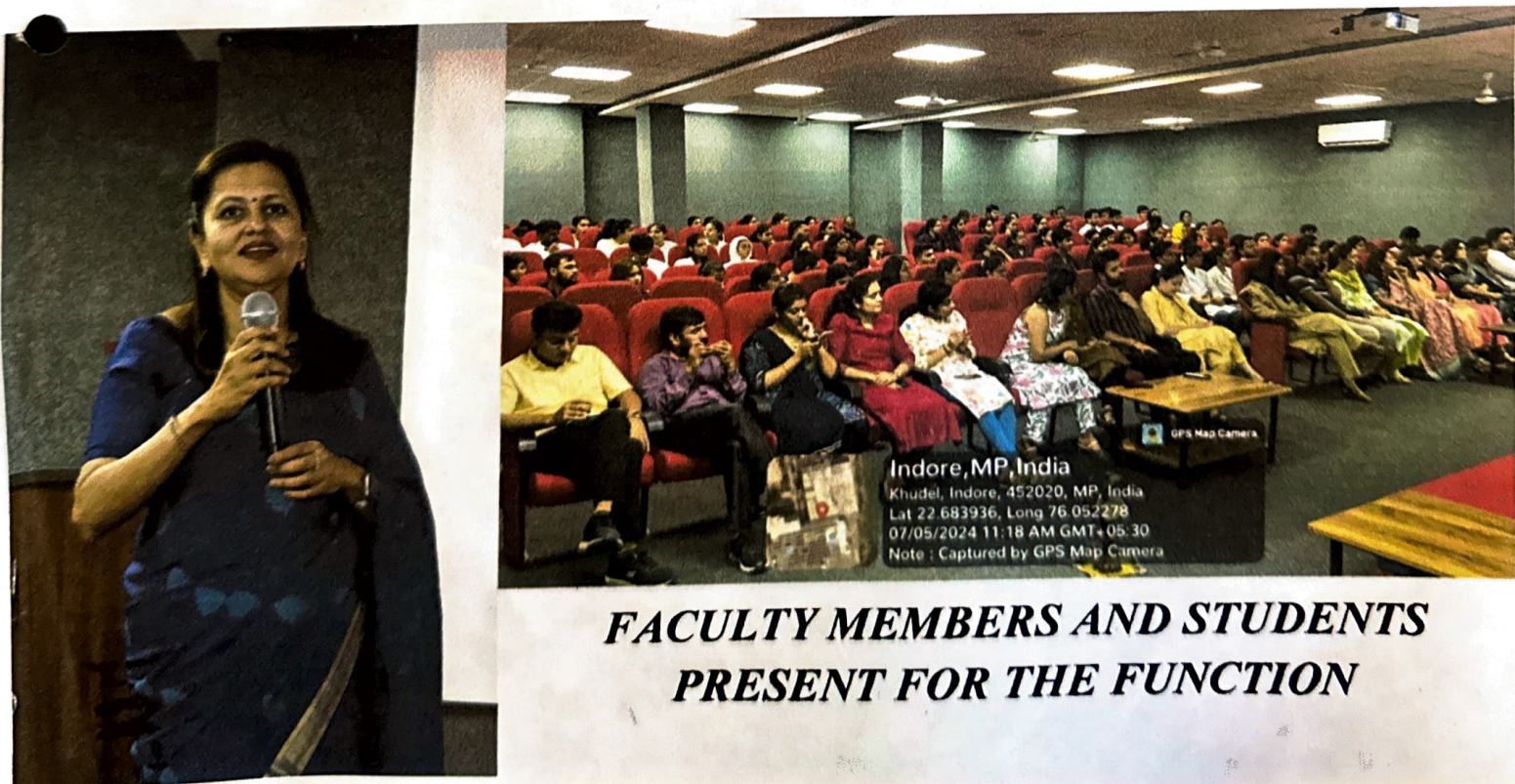
FACULTY MEMBERS AND STUDENTS PRESENT FOR THE FUNCTION