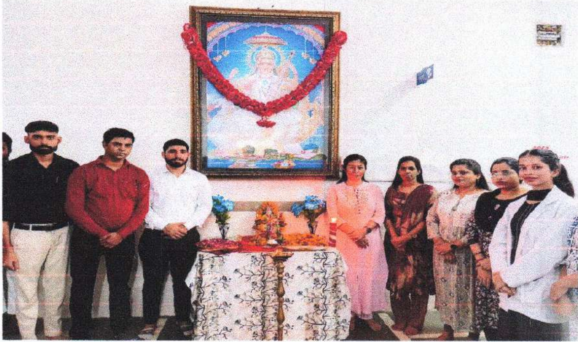
This program was organized by Index Nursing College for one day at Guru purnima, on 22-07-2024 at 10.00 Am to 12.00 Pm. In this occasion Participate teachers & students.