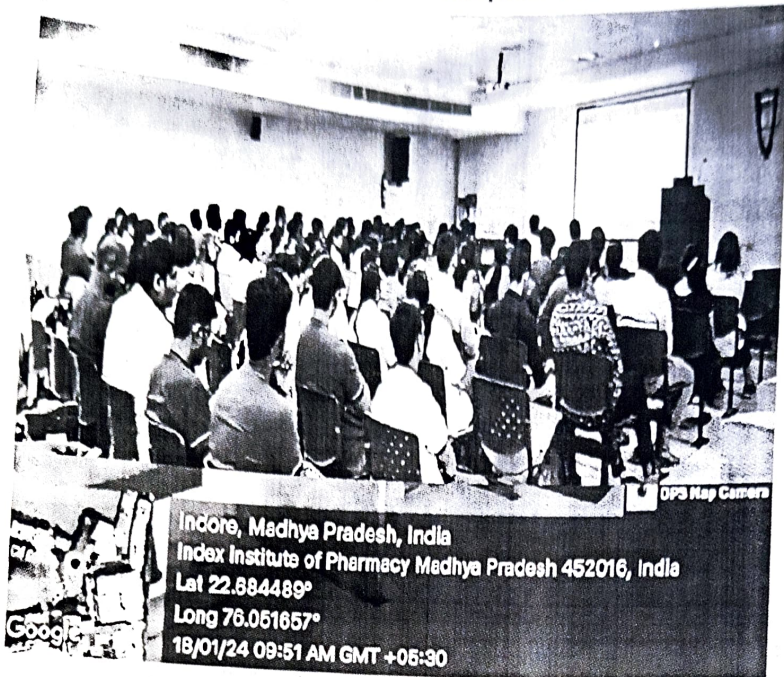
Session in Progress "Interpersonal Skills"