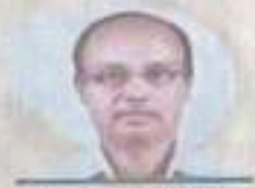
Dr. Prem Nyati Excellence Award in clinical pharmacology